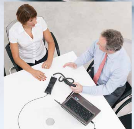
Developed in practice: Plathosys products

As a medium-sized family business based in Friedrichsdorf near Frankfurt am Main we specialise in the development and implementation of special customised solutions. Pioneering products and flexibility are our hallmark. Ideas are developed in our technical department. We work closely with our partners and manufacturers to provide you with tailor-made concepts.