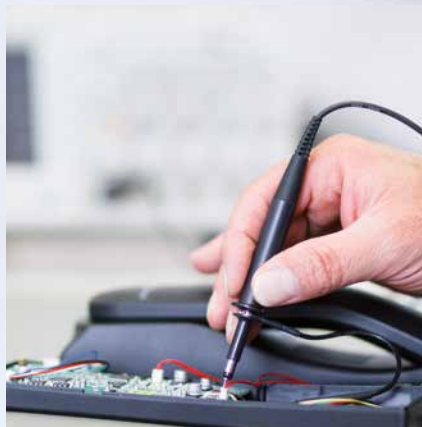
Our knowledge – your solution

In more than 45 years we have proven to be a reliable and highly qualified partner in the field of telecommunications, information technology, automotive, aviation and engineering as well as for specialized traders and wholesalers. The latest products and solutions are complemented by the know-how of our sales team providing an optimal consulting and service capability giving us both national and international success.